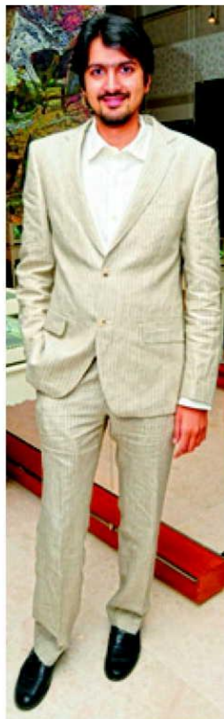
● Ricky Kej