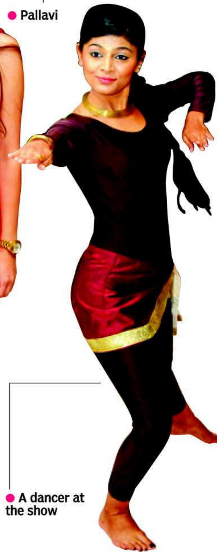
● A dancer at the show